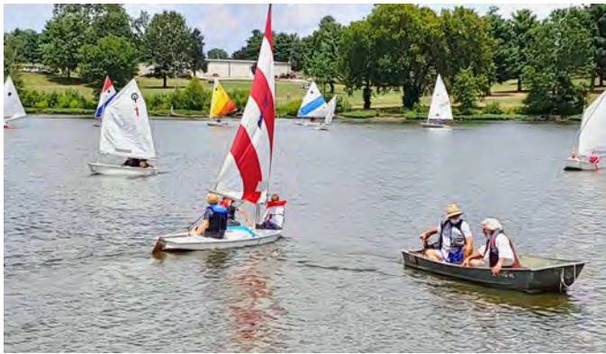
CRSA Sunfish and Optis sailing for the Youth Sailing Program at Jacobson Park Lake in Lexington, with the safety chase boat.