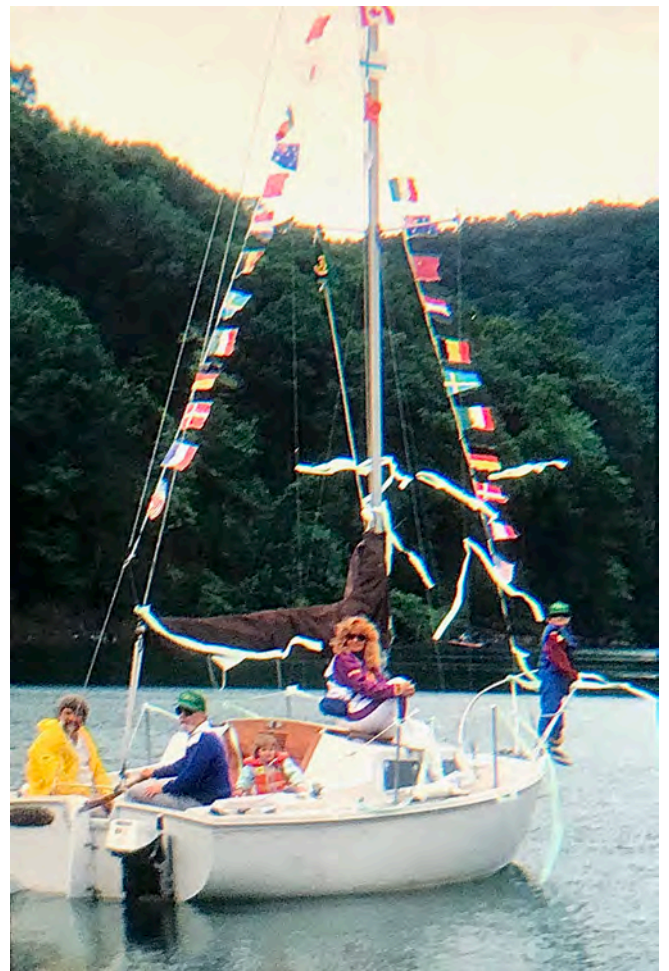
From May 1992 an unknown captain heads out for a raft up in a nicely decorated boat.