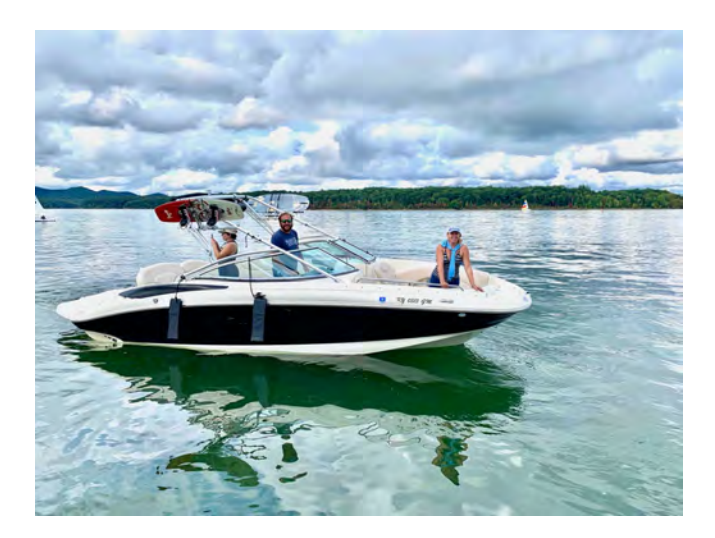
The Westfall family provided the Safety Boat duty for the Regatta.