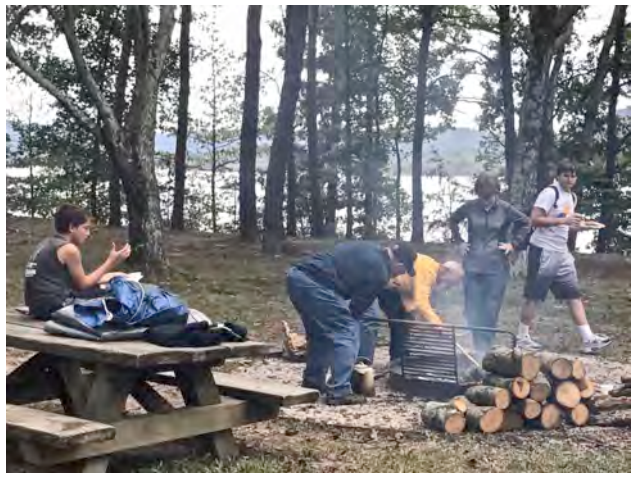
The fire took a little while to get started.