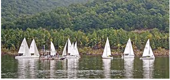
Sunday's start was pretty calm.