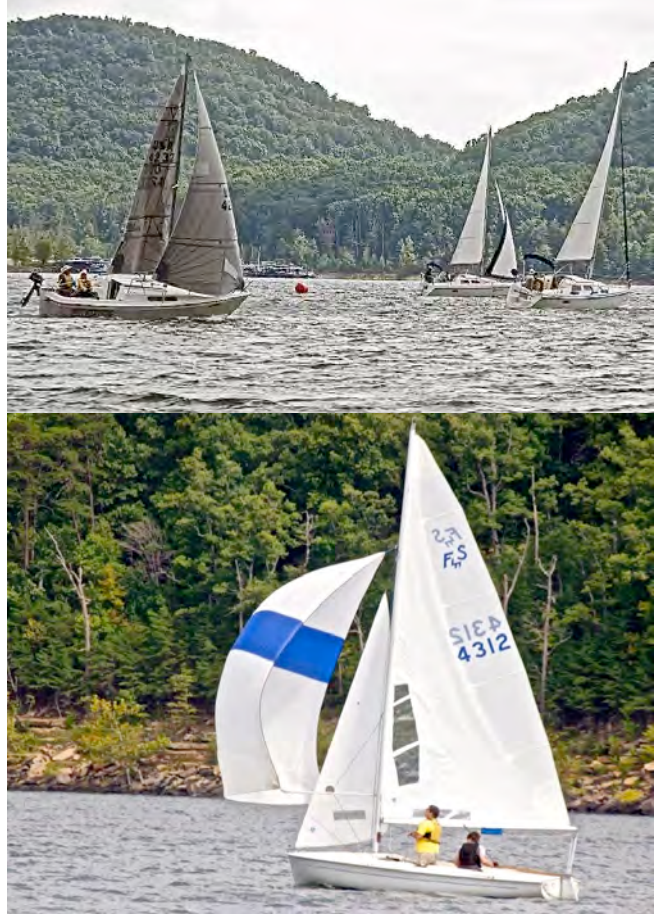
Some of the boats racing in the Regatta