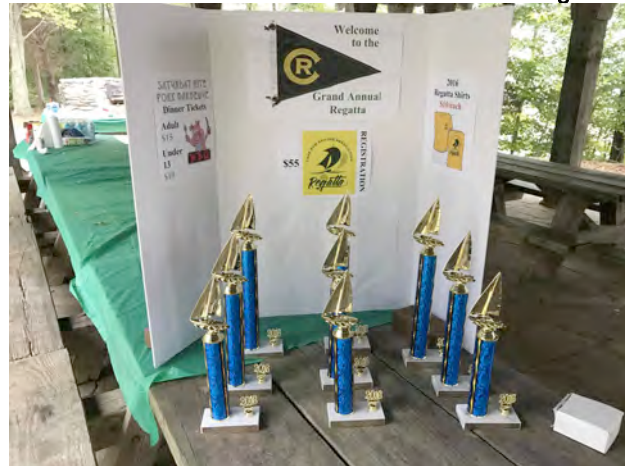
Trophies for the three classes of boats.