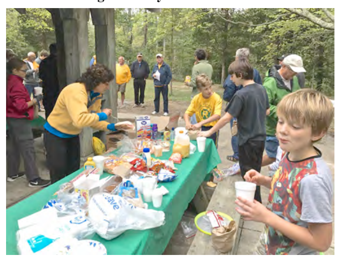
Racers made lunches to hold them until dinner.