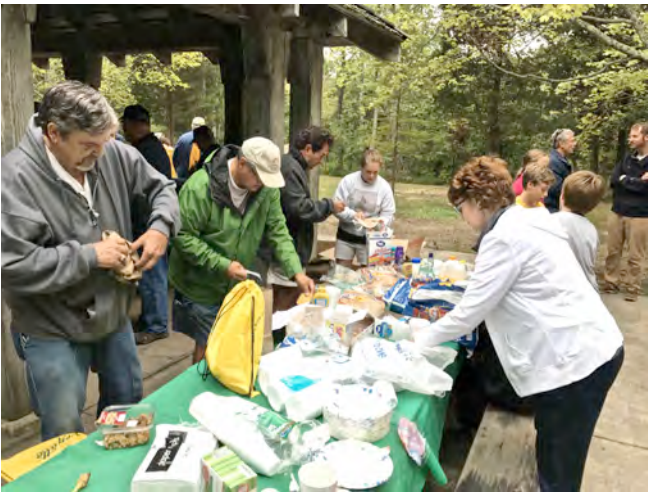
The yellow Regatta Bags were great for lunches.