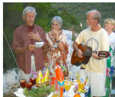
The Kalamos crew does a lovely musical poem as the presentation part of the cocktail competition held toward the end of the Flotilla trip.