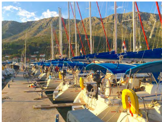
The ACI Marina in Dubrovnik was the pick-up spot for the boats.

Here are some pictures. If you come to the CRSA Awards Banquet on November 15 th at Spindtop you will see lots more. The entertainment program for the Banquet is a slide show on the Cruise.