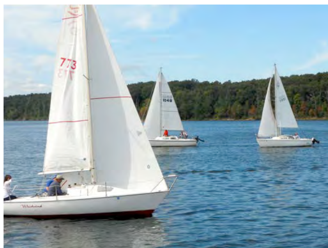
Cruisers cross on the course.