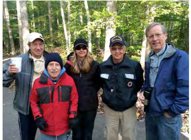
The Race Committee and local Coast Guard Auxiliary had their hands full all weekend with the weather.

You will notice there are NO pictures of boats on the course. The wind was such that everyone had all they could do to be safe and handle the boats much less worry about taking pictures. The relentless flagellating of the sails convinced everyone to leave their camera's below deck.