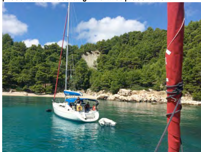
Kalamos with the Dinger's and Buff's moors in a typically picturesque cove.