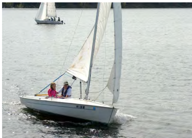
A Flying Scot moves smoothly through the water.