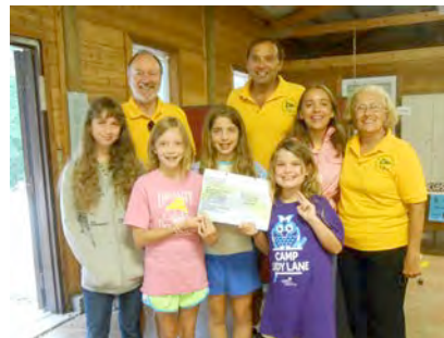
Scouts presented thank you posters to the instructors.