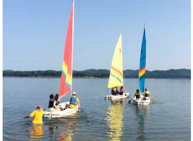
Boats head for "Pirates Peninsula" across the lake.