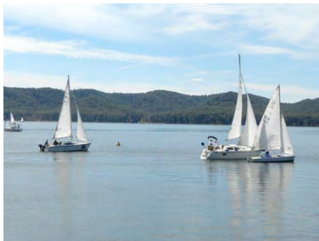
A Cruiser blankets a Daysailer.