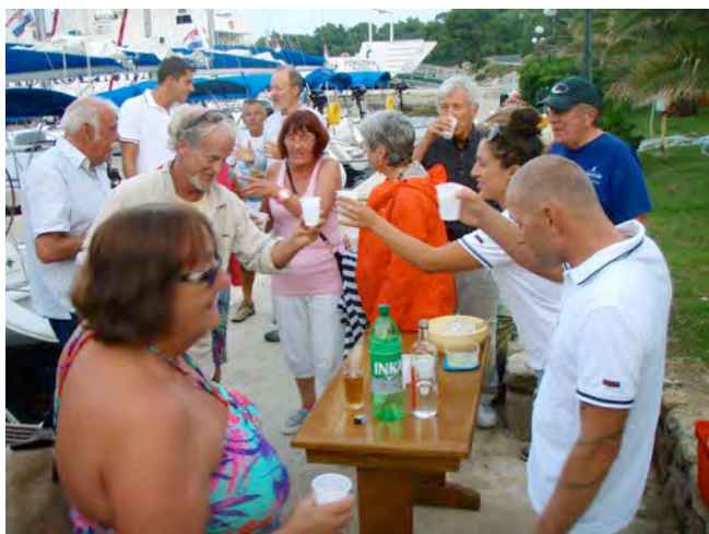
A "Gin and Tonic" party involved the whole Flotilla.