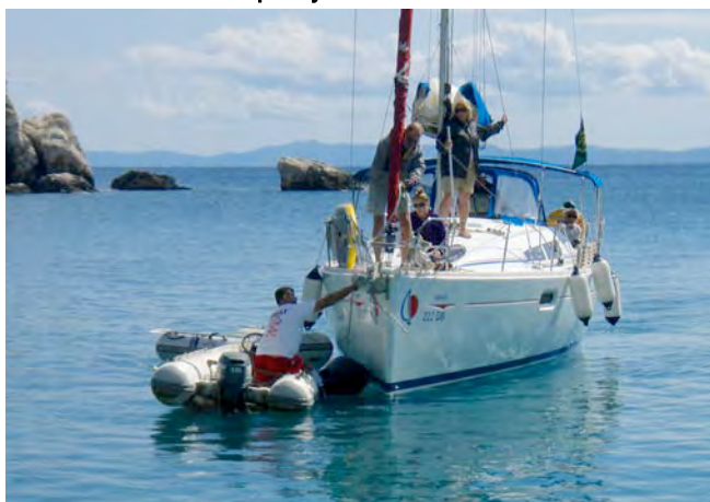
A mooring owner helps Marenda tie off for the nite.