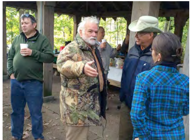
Warm clothes were basic requirements for 2 days.