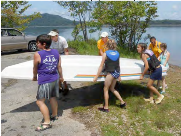
Scouts loaded and unloaded hulls.