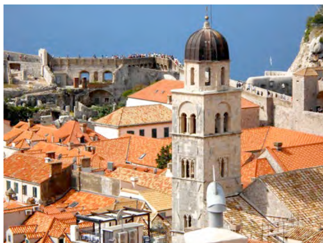
Everyone on the Flotilla took extra time to do some touring. A Favorite spot was the Wall in Dubrovnik.

To see many more pictures from the Croatia Cruise come to the CRSA Awards Banquet on November 15 th at Spindltop Hall. See caverunsailing.org for registration details.