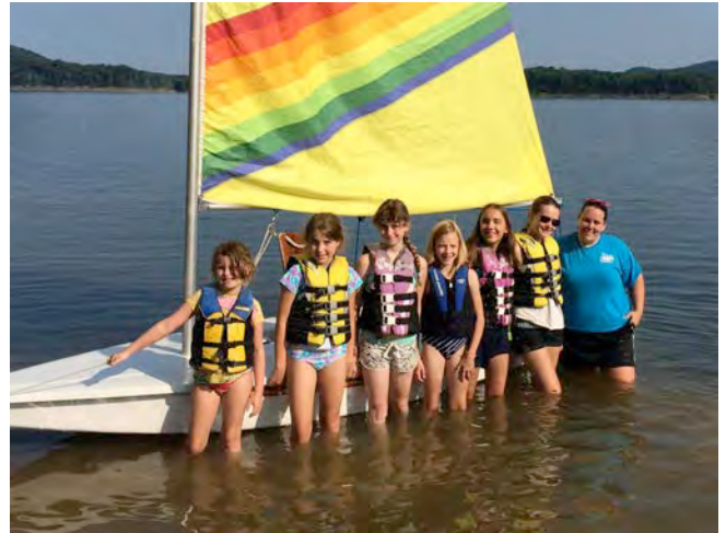
Scouts proudly pose with one of the "Barnett's."