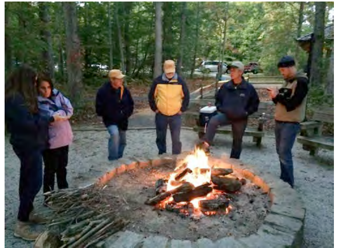
The campfire was a welcome stop both days.