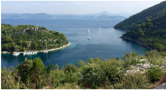
A hike up the hill to an overlook led to an incredible view of the Flotilla boats and the Adriatic scenery.