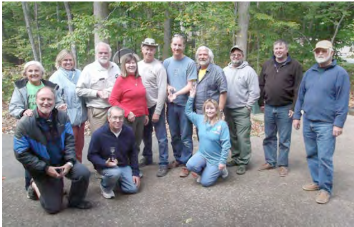
Winning captains and crews posed for a group picture after the award ceremony.