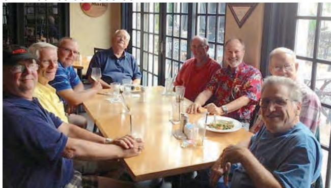
Distinguished - well mostly - CRSA Dinghies enjoying getting ready for lunch at the Signature Club of Lansdowne Cellar Bar and Grille.