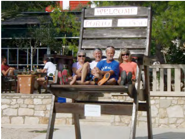
The Kalamos crew took a break in the welcome chair at Porto Rosso.