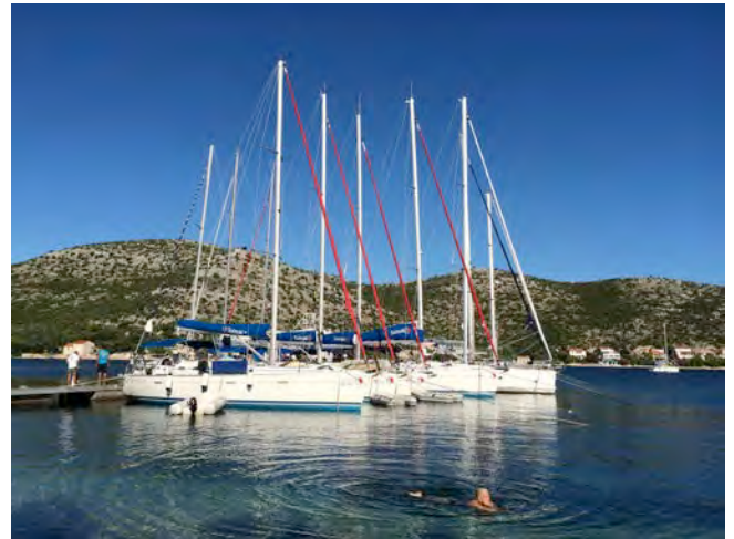
Charlotte Lubawy swims off shore at Porto Rosso.