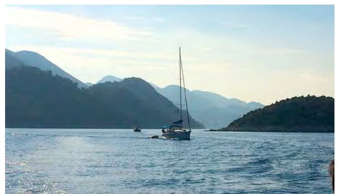
Kalamos exits a pristine anchorage between islands. Look at those hills.