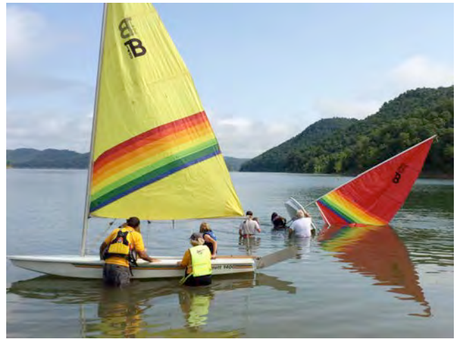
Capsizing drills were incredibly popular.