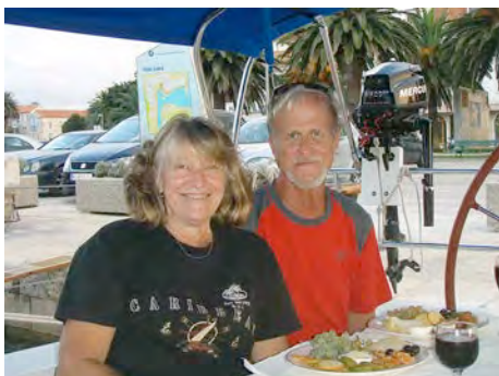
Prince and Jim enjoy a delicious on board meal complete with Croatian wine at Vela Luka on Korcula Island.