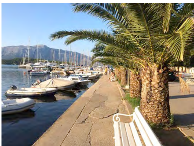
A picturesque dockside stop.