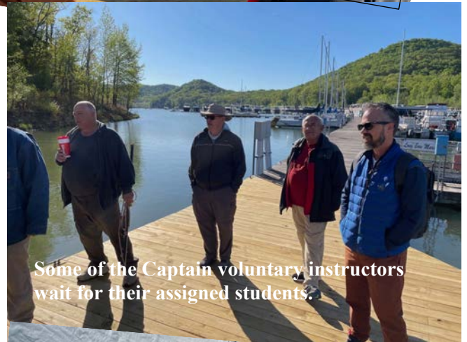
Some of the Captain voluntary instructors wait for their assigned students.