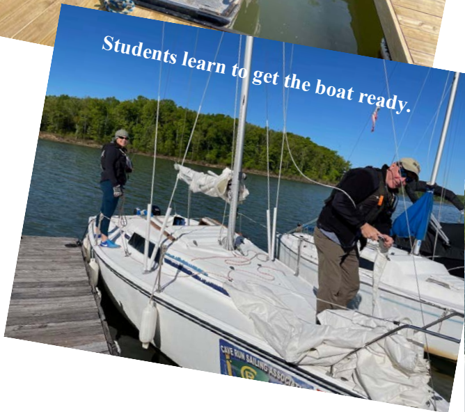
Students learn to get the boat ready.