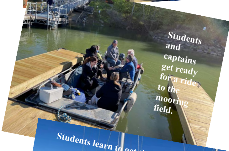
Students and captains get ready for a ride to the mooring field.