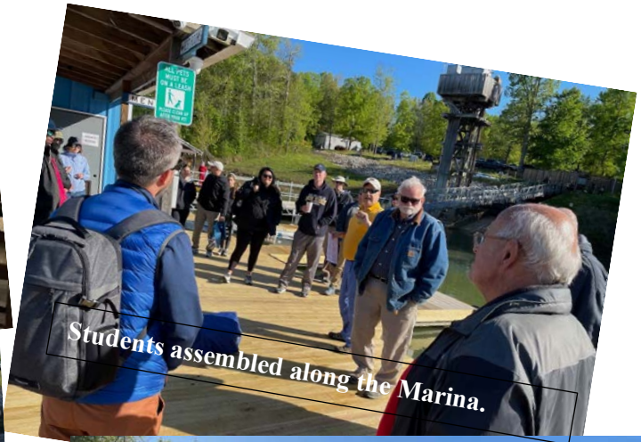
Students assembled along the Marina.