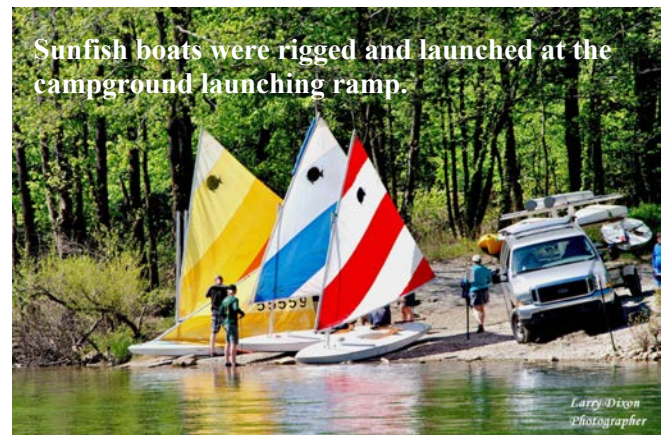
Sunfish boats were rigged and launched at the campground launching ramp.