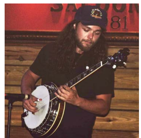
Live musical entertainment will be provided at the Charity Regatta Cookout. Come listen and enjoy.

LAB , with the Regatta, is an opportunity for new sailing students to learn how to apply what they learned in classroom sessions, and directly participate in sailboat racing. Captains in the Bluegrass Charity Regatta will be asked to take students on their boats and "show them some ropes."