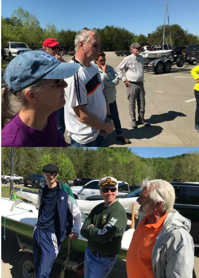
Captains and Crew learn about the course.