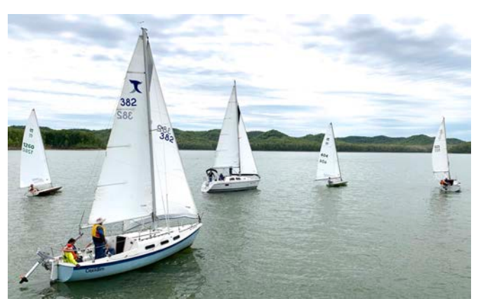
Some of the boats racing at the beginning of the second race of Race Day #1.