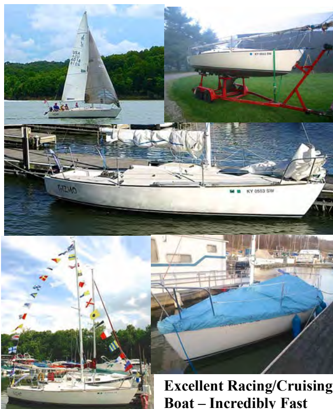
Excellent Racing/Cruising Boat – Incredibly Fast