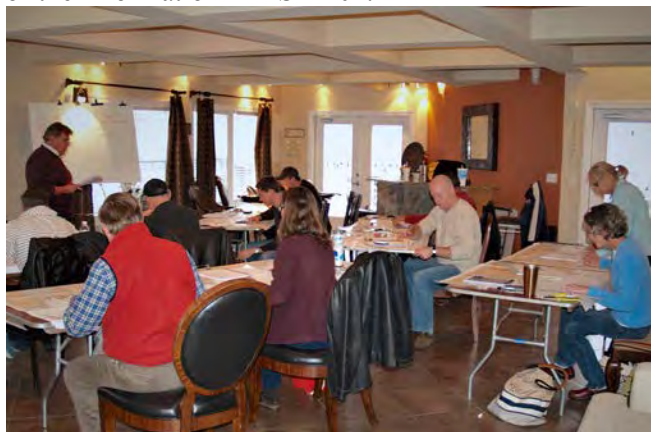
ASA classes work on learning navigation skills.

To enroll in the CRSA Certified Courses individuals must be members of the Cave Run Sailing Association. Although ASA 101: Basic Keelboat Sailing is the introductory course, CRSA recommends that the enrolling students have some sailing experience or have completed the CRSA Beginning Sailing Classes May 15 – 20 described in the opposite column on this page in order to take the best advantage of the information in ASA 101.