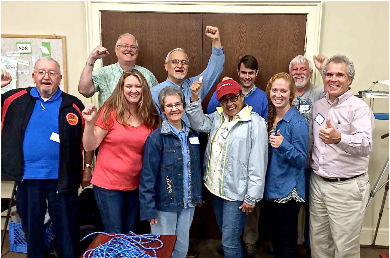
Beginning Sailing Students celebrate completing the classroom portion of the course successfully