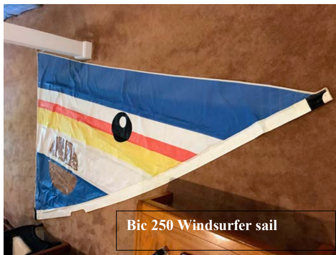
Bic 250 Windsurfer sail

Good to great condition Bic 250 Beginner's Windsurfer with multi-colored sail pictured below. Incredibly easy and fun to sail. Can be used as a paddle board. All parts including boom, centerboard, skeg, gooseneck etc are there. Board is incredibly stable and once was used by two 12 year old girls who were able to sail on it together. Great for teenagers or adults wanting to learn to windsurf. Current owner will provide a brief introduction to operation. Call 859-619-7942 or email Lubawy@uky.edu . $200.