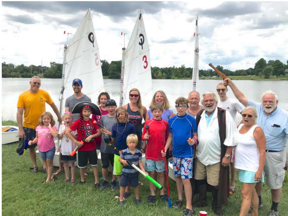
The 2018 Youth Sailing Program ended with a really fun “Pirate Day” the last week in July. A total of 13 youth sailors participated in the program organized by Kelly Glines and Chuck Emrich. Details and lots of pictures inside.

If you can volunteer a small boat, i.e. Sunfish or Laser, please contact Loud Trost. They are needed. If you can help with either activity please contact Lou, jonitrost@gmail.com or Ben, ben.askren@gmail.com today.