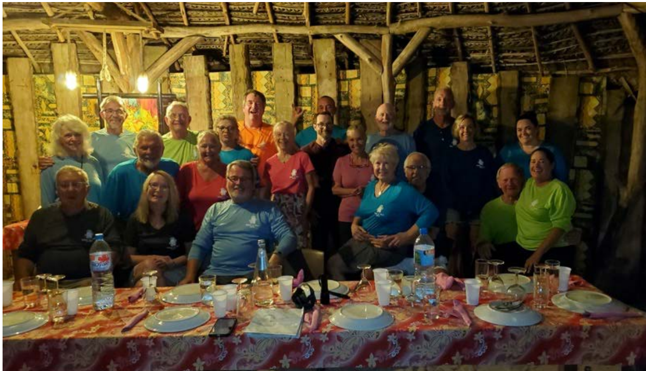
Picture of the 2021 CRSA Tahiti Cruise Participants