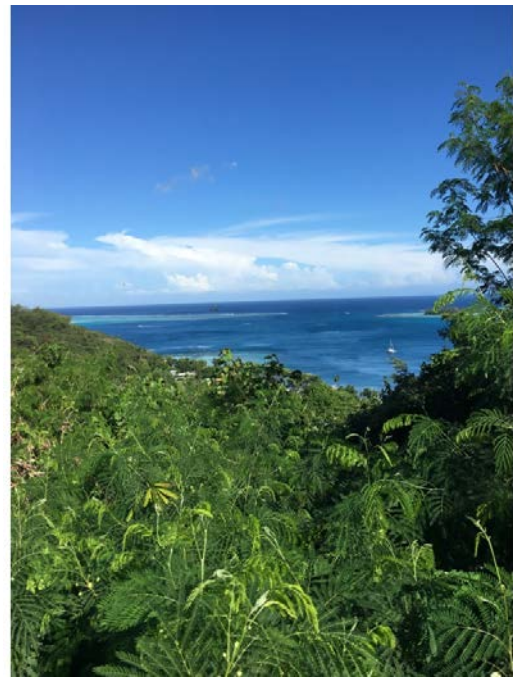
The hiker’s view.