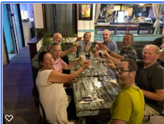
Crew of La Bougainvillea enjoying a meal at the Bora Bora Beach Club.