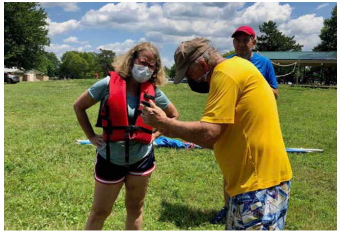
Instructors check items in the cloud.