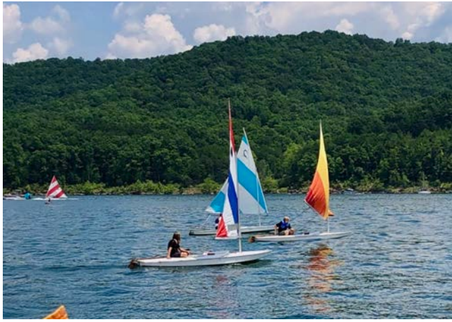
Junior sailors held their own at the starts.