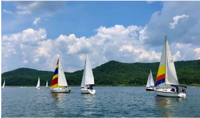
Cruisers flew colored jennies making for nice pics.