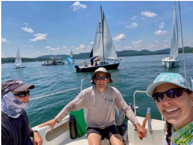
Ben Askren had a great time with close friends.