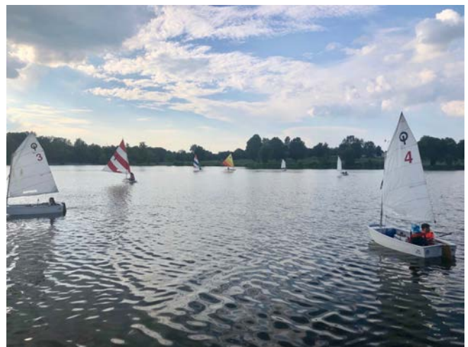
Boats and sailors are finally on the water and look great!