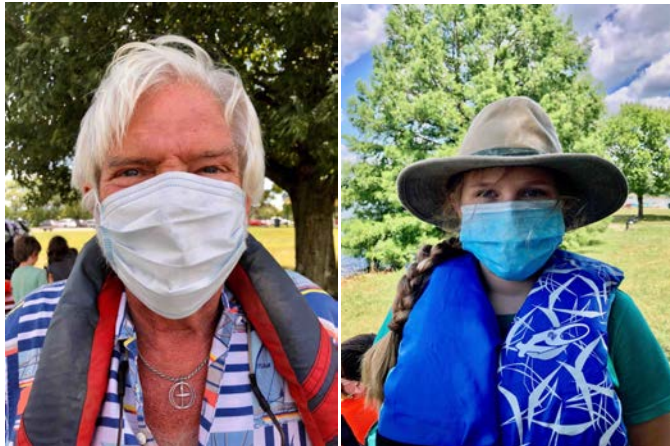
Youth Sailing instructors and helpers wear CDC recommended and statewide mandated protective equipment.