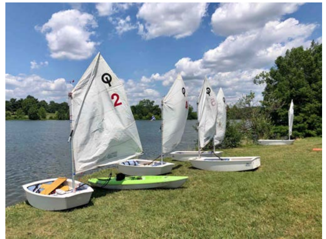
CRSA Prams are on shore ready for launching