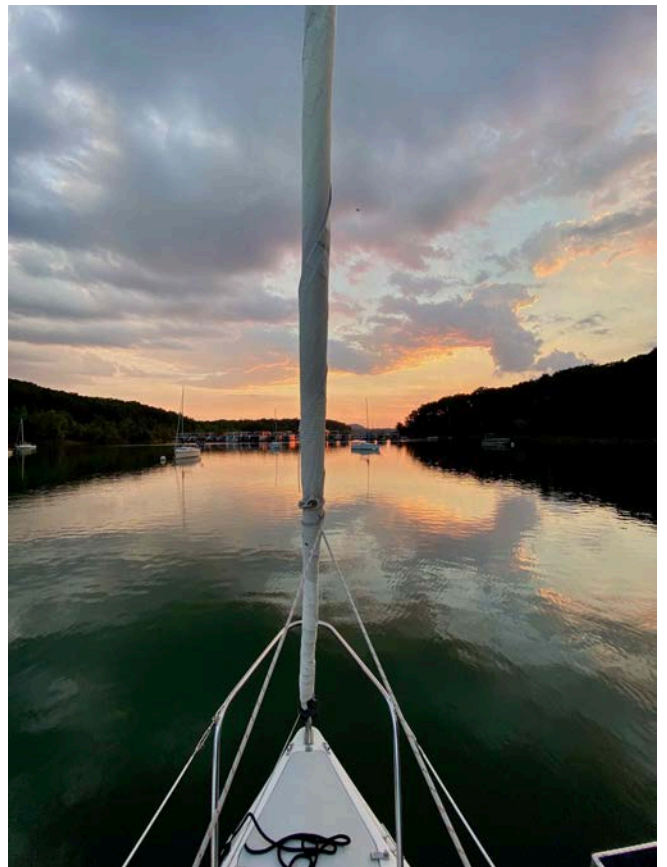
Another really lovely sunset on Cave Run was on display after the days activities.