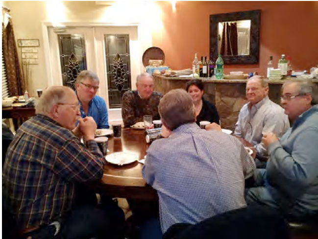
CRSA members enjoy some food before the presentations.