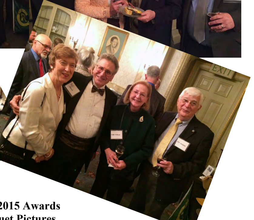
More 2015 Awards Ranquet Pictures