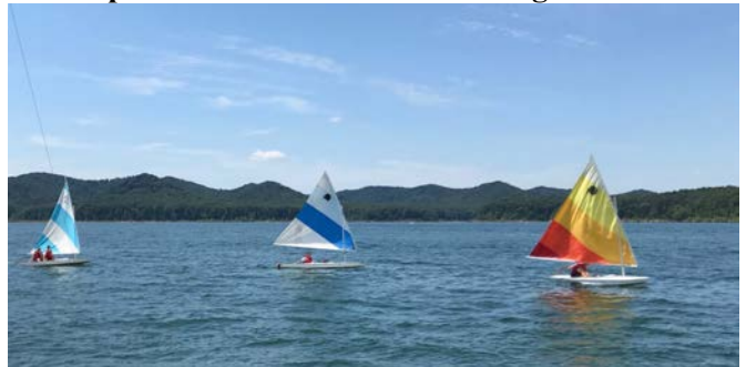
In some races scouts sailed close together.