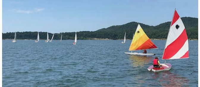
Less experienced scouts were following the fleet.