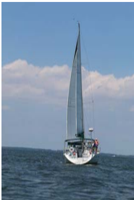
Left GripFast sails away from the fleet in pretty light air. Many boats did not even finish the race the wind that day was so light.