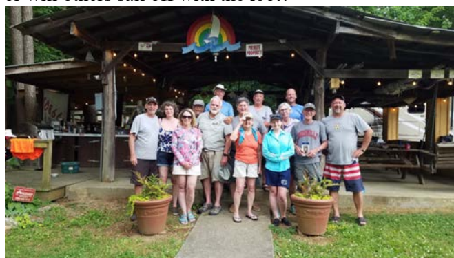
Part of the sailors and crew at the Port Oliver Regatta.

The real questions are will Cave Run Sailing keep the Huddleston Cup in 2020 or will Port Oliver have a clear vision and see fit to reclaimed it? In late September on Saturday, 28th and Sunday the 29th Cave Run Sailing has the Grand Annual Regatta on Cave Run Lake. Can Cave Run Sailing stand tall and own the Grand Annual or will others sail off with the loot?