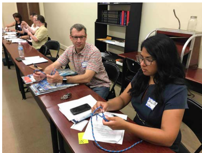
Concentration was required to learn to tie sailing knots.