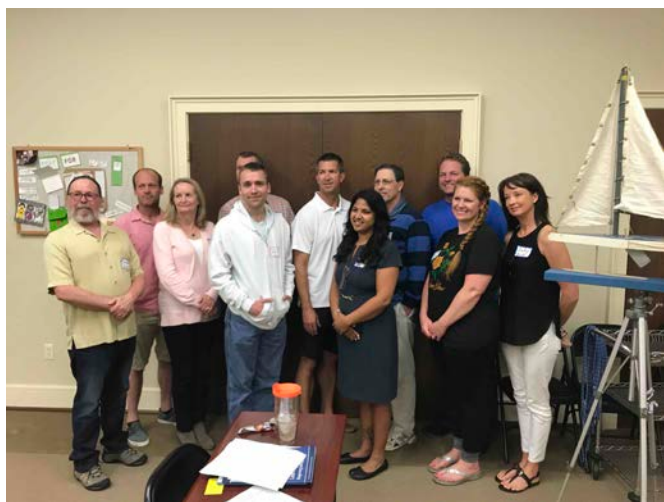
Beginning Sailing Students pose for a group picture.

Earlier this summer 12 students completed the CRSA Beginning Sailing class. The course consisted of two evenings of classroom work followed by a weekend “on the water lab.”