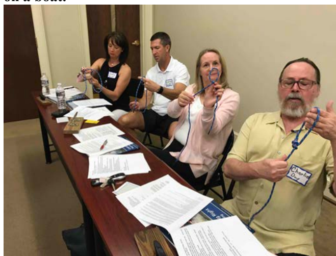
Students proudly show off their mastery tying a bowline.