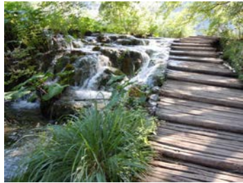
Plitvice Lakes National Park

Croatia is located on the Mediterranean, on the east side of Adriatic Sea east of Italy. We will be on a Sun Sail flotilla based out of Dubrovnik and sailing the Croatian Riviera, also known as the Dalmatian Coast.