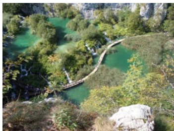
Plitvice Lakes National Park