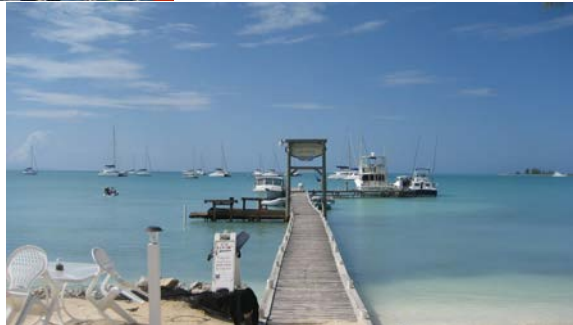
Photo's from November, 2012 British Virgin Islands Cruise