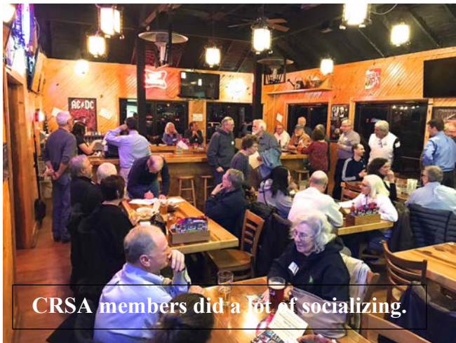
CRSA members did a lot of socializing.