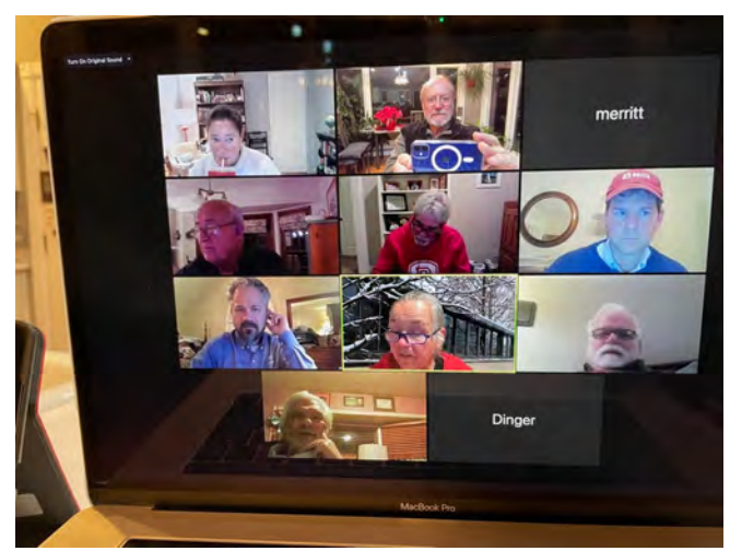
CRSA Board of Directors Met in early February to continue planning activities for the 2021 Sailing Season.

<u>Secretary@caverunsailing.org</u> a couple of days before the meeting for the link.