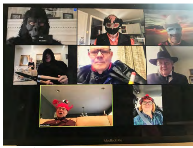
Dinghies even had a costume Halloween Lunch.