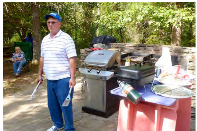
Theta Nu provided a freshly cooked post race meal for everyone.