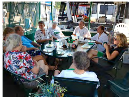
Sailstice attendees enjoy breakfast.

over the lake that evening. A delicious french toast breakfast provided by the Lubawy's awakened us the next morning.