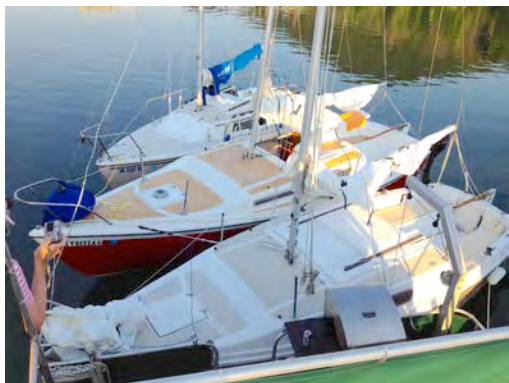
Sailstice raft up behind the Jett Sett III.

perfect opportunity for those needing a comfortable place to lay their head. Approximately 14 rafted up or slept on Beth's boat. We enjoyed pork chops