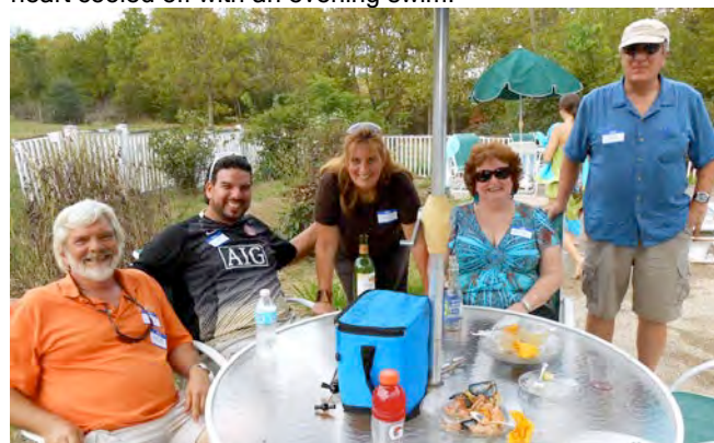
Good food brought smiles to the Summer Social

Some of the Social low country boil. heart cooled off with an evening swim.