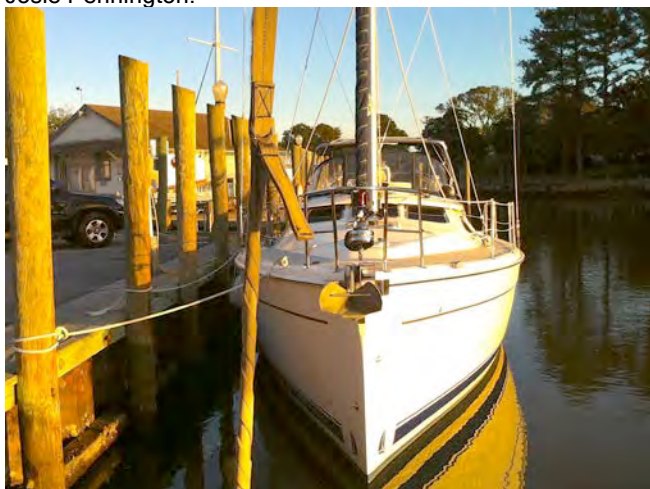
Audacia at the dock in Annonock, VA.