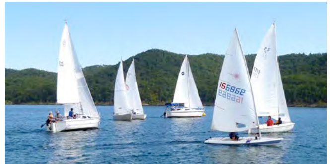
Traffic around the marks was pretty congested at the Charity.